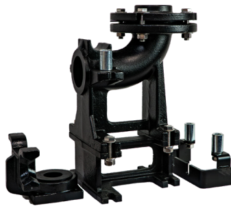
Coupling Foot 801985