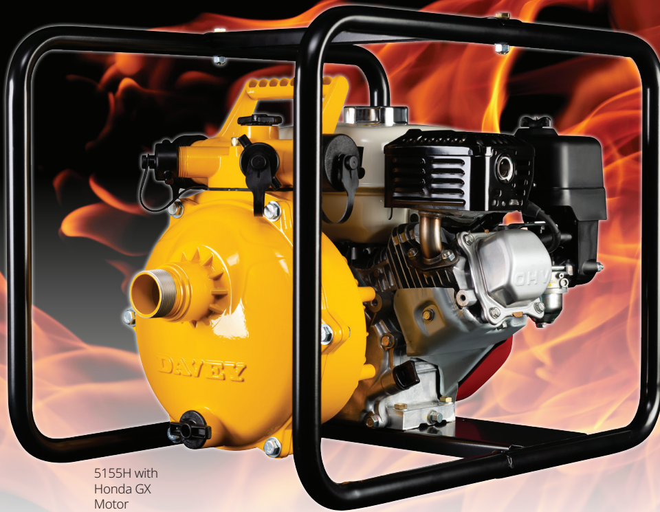
5155H with Honda GX Motor