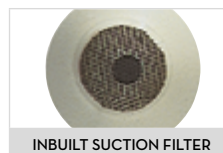
INBUILT SUCTION FILTER