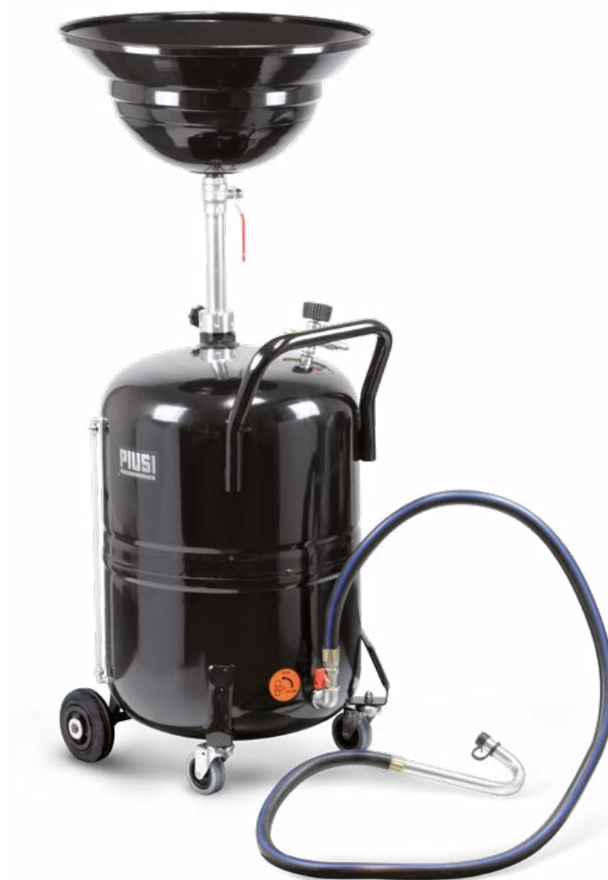
EASY DRAINER 80