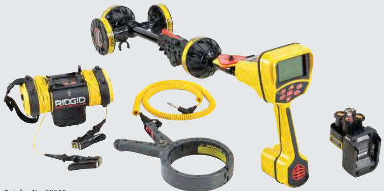
Catalog No: 66508